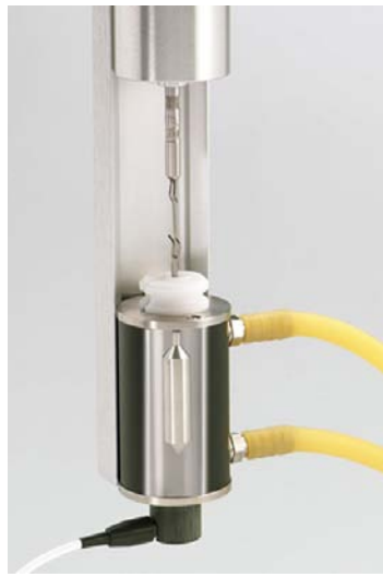
Figure 4A: Brookfield Small Sample Adapter