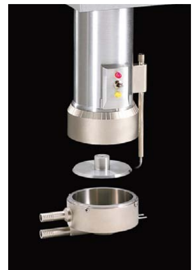
Figure 4B: Brookfield Cone/Plate Spindle Systems