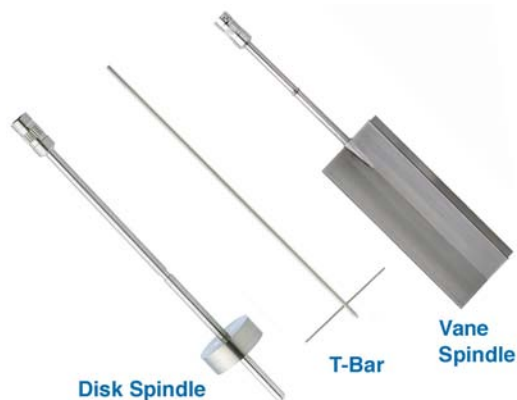
Figure 5: Brookfield Standard Disc-Type Spindle, T-bar Spindle, and Vane Spindle

the choice of standard spindles, T-bars or Vanes is considered. See Figure 5. Vane Spindles are increasing in popularity because they readily give more accurate information on both yield stress and viscosity flow curve behavior, especially when measuring samples with suspensions. The pharmaceutical industry devises test methods which accomplish the types of yield stress and viscosity measurements shown in Figures 1 and 2. These are multiple step tests, which control the speed and time of rotation for the spindle immersed in the material, as well as the temperature of the material during test. These methods are either programmed directly into the instrument or they are constructed on a PC using software such as Brookfield's Rheocalc. See Figure 6. The advantage of the DV-III Ultra Rheometer is that it can work in stand-alone mode running a programmed test entered on the instrument keypad or it can operate under PC control. In both cases the security of the test method is a key requirement so that the same procedure to measure the material is guaranteed, time after time.