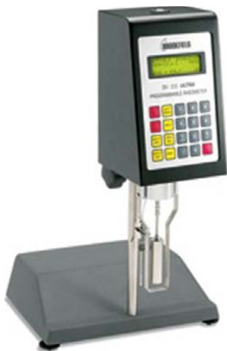
Figure 3: Brookfield DV-III Ultra Rheometer

The preferred instrument used by the pharmaceutical industry for these types of measurements is the DV-III Ultra Rheometer with appropriate choice of spindle system. See Figure 3. For expensive formulations with precious ingredients, the Small Sample Adapter or Cone/Plate type instrument are selected because they require small sample sizes, 16mL or less for the former and 2mL or less for the latter. See Figure 4A and Figure 4B. For materials that are plentiful and can be tested in a beaker,