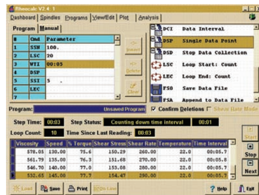
Figure 6 Bottom: Viscosity Data Table From A Flow Curve Test