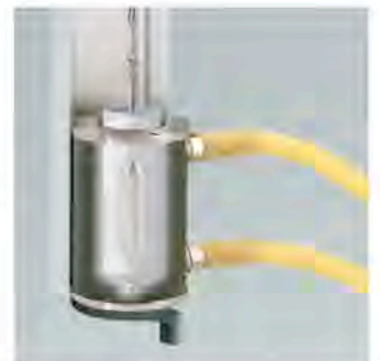
Figure 3: Cutaway of Spindle in Small Sample Adapter

Some mixtures start to deteriorate almost instantaneously when poured from the blending apparatus to the glass. Others tend to hold together for a longer time, but the question is whether they will hold together long enough. When the separation is complete, drinking the beverage from the glass has two possible outcomes – you get a mouthful of liquid and a nose-full of “slush” or you try and shake the glass a tad bit, hoping to reconstitute the mixture, but maybe ending up with messy, sticky results.