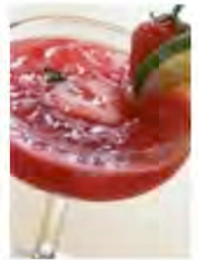
Figure 1: Frozen Margarita Beverage

C hallenge: How do you keep a frozen beverage held in suspension as long as possible? An ice-blended Margarita, for example, has the consistency of “slush” – much like partially melted snow. (See Figure 1) When the liquids are blended during preparation of the drink, there is bonding between the ice (crushed into fine particles), the pre-mix and any added liquor. The question is how long can this suspension be maintained, which in turn affects customer satisfaction with the beverage.