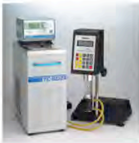
Figure 2: Brookfield Viscometer with Small Sample Adapter and Refrigerated Circulating Bath

This state of suspension can be measured in a laboratory or production area using a standard benchtop rotational Viscometer and Small Sample Adapter accessory with a Refrigerated Water Bath. Figure 2 illustrates a test system configuration that can be used to quantitatively measure the “in suspension” viscosity of the slush, as well as determine when and how rapidly the suspension starts to separate. This instrumentation can also control temperature variations from a frozen state to an ambient condition, thus simulating an actual situation that a consumer would experience.