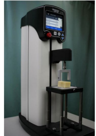
Figure 1 CTX Texture Analyzer with Wire Shear Plate (TA-WSP)