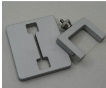
Figure 2 TA-WSP 0.33 mm diameter wire probe used for testing