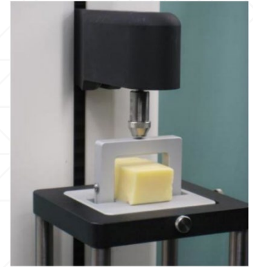
Figure 5 Sample during testing