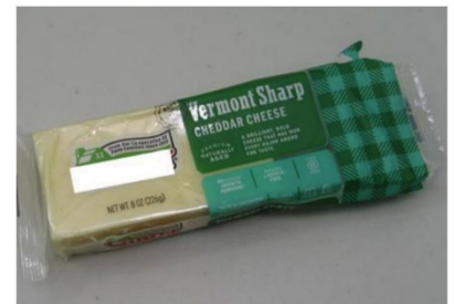
Figure 3 Sample for testing