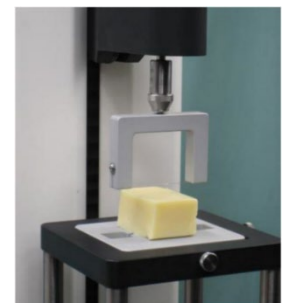
Figure 4 Sample before testing