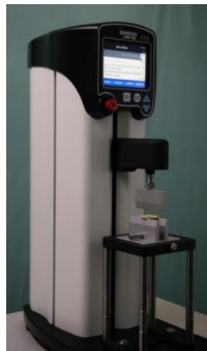
Figure 1 Brookfield CTX Texture Analyzer