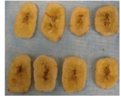
Figure 3 Sort out samples that are similar in shape, size, and thickness for testing