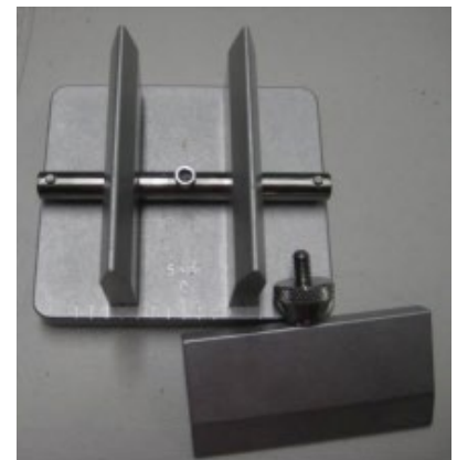
Figure 2 Three Point Fixture (TA-TPB)