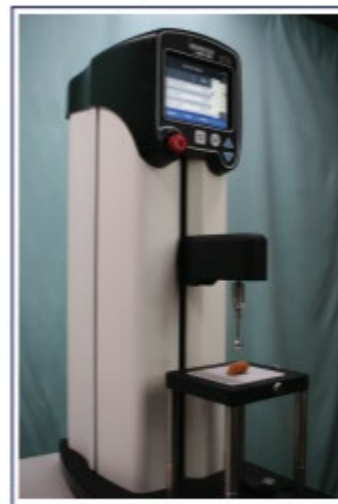
Figure 2 - CTX with a 10 kg Load Cell (XCTX)