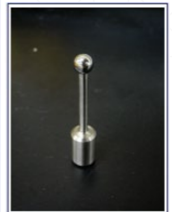
Figure 3 - 10 mm Spherical Probe (TA38)