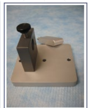
Figure 3 - Lipstick Cantilever Fixture (TA-LC)