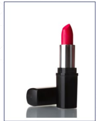
Figure 1 - Lipstick