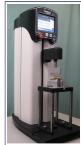
Figure 1 CTX Texture Analyzer with Fixture Base Table (TA-BT-KIT) and Three-Point Bend (TA-TPB)