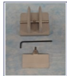
Figure 2 TA-TPB Fixture used for testing