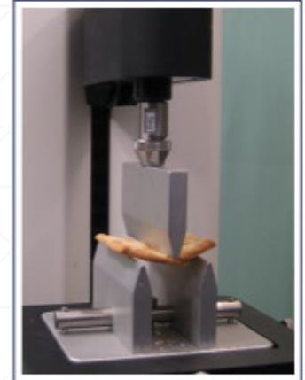
Figure 4 Sample during testing