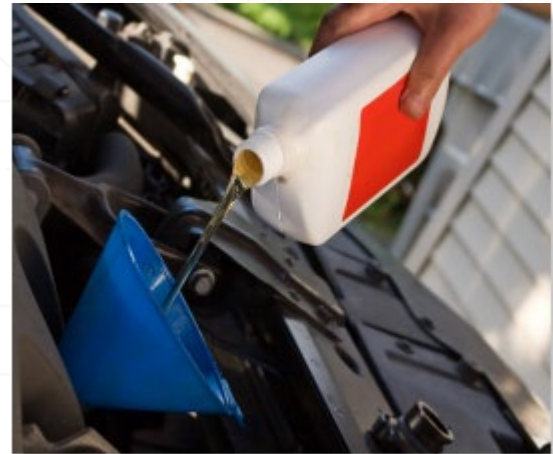
Motor Oils: 20W-50 (Green) & 10W-40 (Red), 25C, RVDVX, UL Adapter

The viscosity measurements confirm that both motor oils maintain consistent viscosity at 25°C across the tested speeds. The higher viscosity of 20W-50 motor oil indicates its suitability for applications requiring thicker lubrication compared to 10W-40 motor oil.