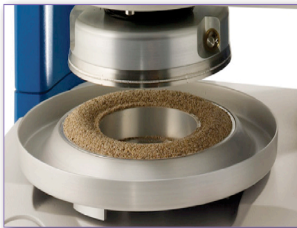
Figure 2: Container with Powder in Loose-Fill Condition

One type of instrument that can predict this change in density is called a "shear cell". (See Figure 1) The powder is poured into a container of defined volume, weighed, and the