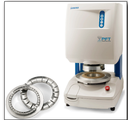
Figure 1: Example of Shear Cell Instrument: Brookfield Powder Flow Tester

The important fact to understand is that powders naturally consolidate with time due to their self-weight. The "loose-fill density" is the physical attribute that characterizes the powder at the outset. Voids in the powder, which occur naturally during the filling process, gradually disappear as the particles rearrange themselves. The air entrapped during filling gets squeezed out and the particles achieve a closer packing condition which in turn increases the density.